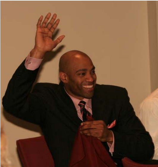
Vince Carter bids on an auction item at the Annual Dinner

2009 for will go down in history as a banner year in the addictions field for Volusia and Flagler County. The Foundation has been instrumental in several events during this calendar year including the Foundation's Annual Dinner and Auction honoring NBA All-Star and new Orlando Magic player, Vince Carter. Vince was also honored at the Daytona International Speedway as the honorary pace car driver for the Coke Zero 400. Thanks to Vince, this year's event broke all previous records for money raised!